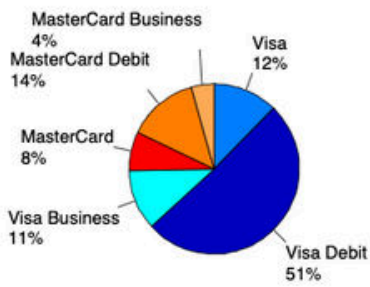
Current Month Sales